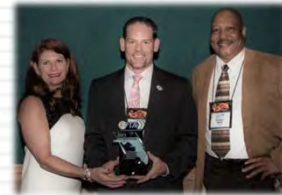
"Bus Safety Excellence Award"