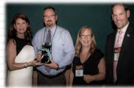
1 st Place – People's Choice Award – Aging Tree "Reclaim your Independence"